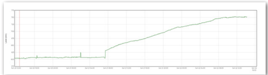
Graph showing level increases in the chamber

Had these sites not been monitored, the client would have been unaware of the issues which could have resulted in properties flooding or pollutions into local watercourses and costly fines from the Environment Agency.