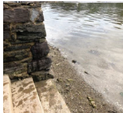
Tide ebb at 4.2m chart Datum

As a result of the steep catchment, I&I from rainfall precipitation is present throughout the entire wastewater network. Although there has only been a few significant rainfall events, it can be concluded rainfall has a major impact on the available capacity within the waste water network when coupled with a spring tide.