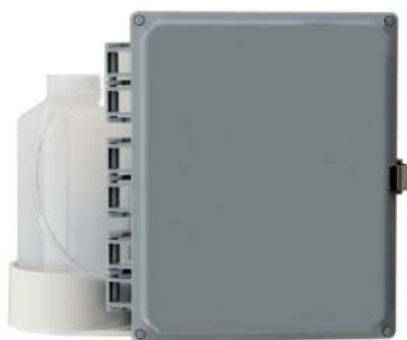
Automatic Chemical Cleaning System