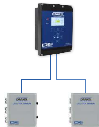
Multiple sensors on a single analyser