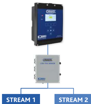
Dual sample feed capability